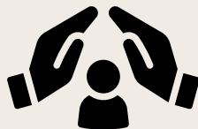
Prayers of Protection