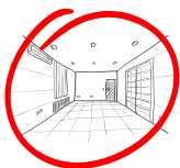
Spaces and Safety