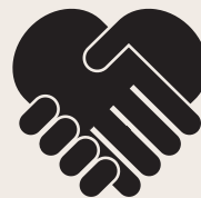
Prayers for Justice