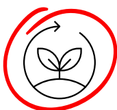
Sustainability and Stewardship