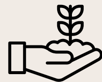
Prayers for Stewardship of Resources: time, knowledge, gifts, privilege, voice, money....,