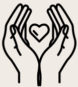
Prayers of Gratitude