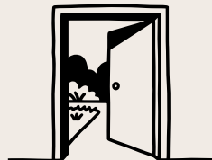
Prayers for New and Old Ministry