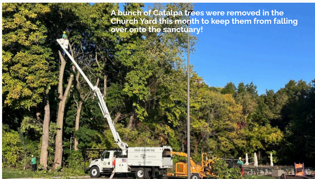
A bunch of Catalpa trees were removed in the Church Yard this month to keep them from falling over onto the sanctuary!

As Connections has grown and changed, we are considering making the newsletter bi-monthly. We already combine Dec/Jan and June/July together and think this works really well. But we'd love your feedback on that idea. Let us know what you think!