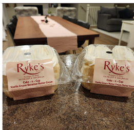
Ryke's gets the crown for BEST CAKE!