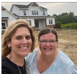
Cake + Parade of Homes

Shockingly, it worked. We didn't just sit at home either — we ate cake at the Parade of Homes, cake while shopping in Grand Rapids, and cake during a covert mission in southern Michigan that ended with us sprinting into a random bakery in Portage during a monsoon. Friendship builds memories, and apparently also a strong tolerance for sugar.