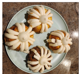
Nothing Bundt Cake