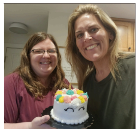
Cake + a comfy night in!