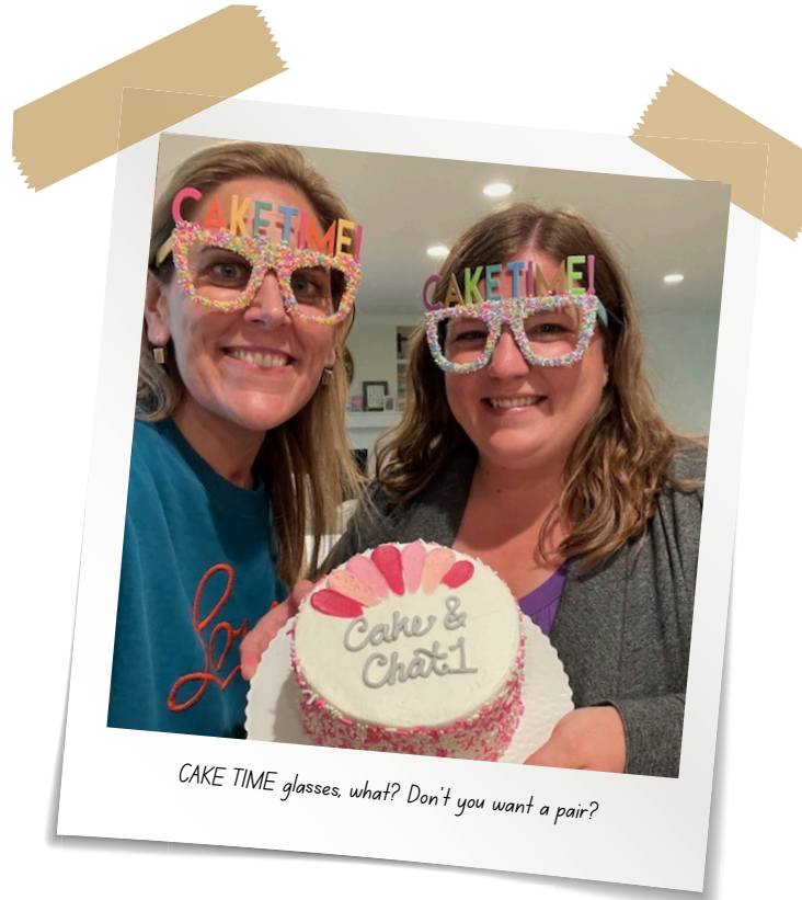
CAKE TIME glasses, what? Don't you want a pair?

The rules were simple: the night could be one hour or three, the house could be spotless or look like a tornado auditioned for a role, and pajamas were always acceptable. The point was connection... and cake. Mostly connection. But also cake.