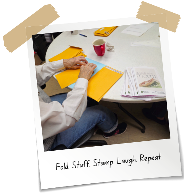
Fold. Stuff. Stamp. Laugh. Repeat.